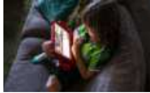
"People have basically thought, what is it we do offline? Do we let young people into strip clubs, into bars, buying alcohol, buying cigarettes? What are the norms that we have and what are the norms that we want to have online?"

It's August, and a show of hands in an auditorium filled with 300 students at All Saints Anglican School in Australia shows that few of the Grade 9 and 10 students sitting in plush red seats had heard of the country's impending ban on social media, much less how to prepare for it.