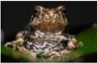
Scientists have since identified more than a dozen Nectophrynoides species that bear live young. N. viviparus is the most widespread species in the genus and the only one found in the Southern Highlands of Tanzania as well as the country's Eastern Arc Mountains, where all other Nectophrynoides species live.

Scientists have newly described three extraordinary species of tree toad that leapfrog over the egg-to-tadpole stage. The females give birth on land to dozens of toadlets, each measuring just a few millimeters long. Live birth, or skipping the egg-laying and larva stage, is extremely rare in amphibians. Among more than 4,000 species of frogs and toads, fewer than 1% are viviparous, or bear live young. This strategy may have evolved as an adaptation in habitats lacking easy access to water where frogs and toads typically lay their eggs, the study authors reported. “Describing these new species that give birth to live young is fascinating and helps us understand the evolutionary flexibility of amphibians, one of the most diverse and ecologically sensitive groups of vertebrates,” said Dr. Diego José Santana,