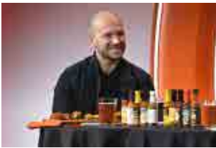
Morning shows, too, have for decades welcomed celebrities into their set kitchens for early-morning meal-making.

Harrelson said that he never thought he'd do the show because he used to think he didn't have what it took to get to the end of the poultry gauntlet. "And now, here we are," he said, victorious.