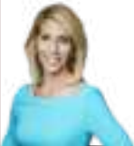
Dana Bash After a steady climb up the leadership ladder, Pelosi first won the speaker's gavel 18 years ago. Then, in 2019, Pelosi took the gavel again, becoming the first person to win non-consecutive terms as speaker in six decades.

Nancy Pelosi, the first and only female speaker of the US House of Representatives and one of the most powerful figures in Democratic politics for decades, has announced she will not seek reelection.