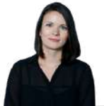
Rebecca Cairns Issues vary from country to country, but national grids often struggle to expand beyond cities due to high infrastructure costs and bottlenecks, regulatory hurdles, unclear government policies, and sometimes, conflict and unrest.

Solar has been touted as the obvious solution to provide clean energy to the millions of people living without electricity. Yet the continent had just 21.5 gigawatts of installed solar capacity in 2024, according to the International Energy Agency. By comparison, China, the global leader in solar power, added 198 GW between January and May this year alone. “The problem that you have in many African countries is that you have scattered, low density population centers,” says Bruno Idini, an analyst at the International Energy Agency (IEA).