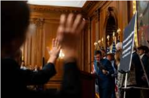
The Bureau of Labor Statistics, already under fire from the Trump administration over the quality of its data, will not release Friday’s September jobs report if there is a shutdown.

Not only are the stakes higher, but a shutdown will also very likely delay the collection and release of some key economic data – including Friday’s jobs report and monthly readings on inflation. That could force CEOs, investors and even Federal