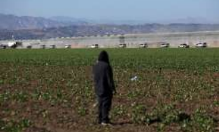
“You can go in and, you know, raid and arrest, get your approval to do that in the system,” the official said. “Then it'll route them through to detention or removal. That entire lifecycle is built into the software.”

Driving that vision is ImmigrationOS, a new platform that consolidates these tools into a single interface. The system, which DHS will start using Thursday, includes workflows that allow agents to approve raids, book arrests, generate legal documents and route