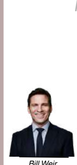
Bill Weir She said extreme weather, trade wars and DOGE decisions to gut USDA support staff has some rural Republicans frustrated with the second Trump term.

It was 1985, and improvised empathy was cool. News reports of families starving to death in drought-stricken Ethiopia were enough to move the lead singer of the Boomtown Rats to assemble a British supergroup to help save them. Bob Geldof, Band Aid and "Do They Know It's Christmas" helped inspire Quincy Jones and Michael Jackson to rally even more star power into USA for Africa, raise hundreds of millions with "We Are The World," and create momentum for a bicontinental mega-concert called Live Aid. And when the Philadelphia stage hit late prime time, Bob Dylan unwittingly gave this wave of pop philanthropy another push. "I hope that some of the money that's raised for the people in Africa," Dylan said, flanked by Keith Richards and Ron Wood of the Rolling Stones. "Maybe they can just take a little bit of it, one or two million, and use it, say, to pay the mortgages on some of the farms that the farmers here owe to the banks." Crop prices were crashing in '85, with bank foreclosures wiping out family farms at alarming rates and pushing farmer suicides to record levels and when Dylan gave a shoutout to those who grow the food that ends famines, it hit Willie Nelson "like a ton of bricks."