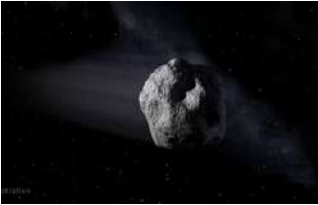
The quasi-moon is expected to remain in its current near-Earth orbit for about another 60 years before the gravitational tug of the sun pulls it back into a horseshoe orbit.

Kamo'oalewa is one of the destinations of China's Tianwen-2 mission launched in May, which aims to collect and return samples from the space rock in 2027.