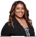
Lisa Respers France The first day of festivities will feature the likes of The XX, Disclosure, Teddy Swims and Devo.