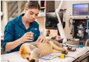
Antibiotics were previously used to treat chlamydia in koalas, but the drugs often interfere with their ability to digest their staple diet of eucalyptus leaves, causing them to starve to death.

"It's based on Chlamydia pecorum's major outer membrane protein (MOMP), and offers three levels of protection — reducing infection, preventing progression to clinical disease and, in some cases, reversing existing symptoms," he added.