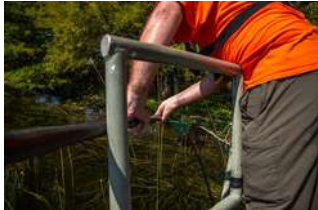
Small panfish and bream float stunned and motionless in the five feet or so of zapped lake around the boat, but the target eels do not seem as susceptible in the marshy edges that are lined with brush.

It's a regular steamy summer morning for the locals, but on this day, there will also be strangers above and below the waters of the lake.