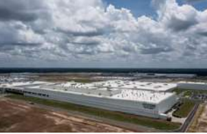
In 2022, Hyundai announced an agreement with the state of Georgia to build Hyundai’s “first dedicated fully electrified vehicle and battery manufacturing facilities in the United States” in Bryan County, the company said.

During the raid, several people tried to flee — including some who “ran into a sewage pond located on the premises,” the US Attorney’s Office for the Southern District of Georgia said.