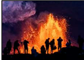
"You as the dancer, you are the storyteller and you carry that history that was written in those mele forward," she said, using the Hawaiian word for song. "To be able to actually see that eruption that's described in the mele."

And the fountains emerged in a remote area, so few got to watch. The other two occurred in 1959 and 1969.