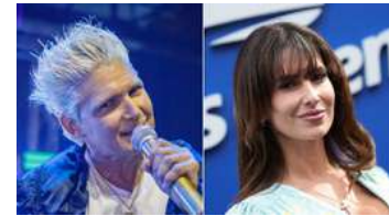
Hilaria Baldwin is joining the Season 34 cast of "Dancing With the Stars."

Hilaria Baldwin, Corey Feldman, a "Boy Meets World" alum and an actress responsible for turning the name "Meredith Blake" into a whole celebrated vibe will be battling in the ballroom on the new season of "Dancing with the Stars." The cast and their professional dance partners were announced Wednesday morning on Good Morning America. Hilaria Baldwin, an author and wife of actor Alec Baldwin, will be paired with Gleb Savchenko, while Feldman, a musician and former child star, will be paired up with Jenna Johnson. A pair of '90s favorites – Danielle Fishel, known best for playing free-spirited Topanga Lawrence on the teen sitcom "Boy Meets World," and Elaine Hendrix, known for her roles in "Parent Trap" and "Romy and Michelle's High School Reunion" among others – are also set to be part of the new season. Fishel and Hendrix will be paired with Pasha Pashkov and Alan Bersten, respectively. Rounding out the cast are: Olympian gold medalist Jordan Chiles, NBA star Baron Davis, reality TV star Dylan Efron, Scott Hoying of Grammy-winning group Pentatonix, Fifth Harmony singer Lauren Jauregui and comedian Andy Richter. They join Alix Earle, Robert Irwin, Whitney Leavitt and Jen Affleck, who were previously announced as season 34 contestants.