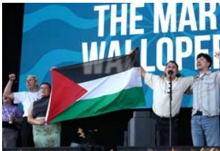
In a post on Instagram, the band claimed that they were "cut off" at the festival, "for having a Palestinian flag on the stage," and called Victorious' initial explanation misleading.

The statement continued, "We accept that, although mics remained live for longer, sound for The Mary Wallopers' audience was cut as described in the band's video and that comments after that were not audible to the public."