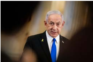
At the same time, Netanyahu refrained from making any official reference to the mediators' proposal, leaving open the possibility of a partial agreement.

Netanyahu stressed that Israel is now at a critical juncture. "We are at the decisive stage," he said, underlining that "defeating Hamas and securing the release of all hostages go hand in hand."