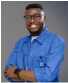
Nimi Princewill Thousands of roles are also threatened in Lesotho's richer neighbor, South Africa.

Four African nations - Libya, South Africa, Algeria and Tunisia - face some of the steepest tariffs imposed by the Trump administration, with charges on exports ranging from 25% to 30%.