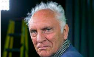
Ironically, more than two decades later Stamp went on to voice the role of Superman's father Jor-El in the TV series “Smallville.”

“He genuinely believed that people like us didn't do things like that,” he said. But his mother, he said, “loved every second of it.”