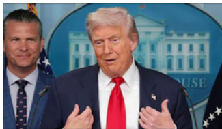
Trump invited Putin to the summit after the Russian leader suggested the meeting. However, the US president has since taken a firmer tone, warning that the meeting could end quickly if Putin refuses to compromise.

"He's a smart guy, been doing it for a long time but so have I ... we get along, there's a good respect level on both sides, and I think, you know, something's going to come of it," Trump noted. He also welcomed the fact that Putin is bringing Russian business leaders to the talks,