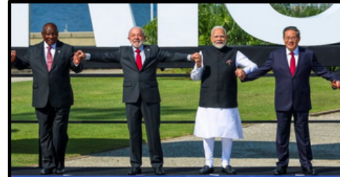
BRICS Brasil 2025

In his remarks at the first plenary session, the prime minister rued the Global South has often received nothing but token gestures on issues like climate finance, sustainable development and technology access. "Countries that have a major contribution to today's global economy have not been given a seat at the decision-making table," he said. "This is not just a question of representation, but also of credibility and effectiveness," he added.